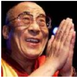
His Holiness, The Dalai Lama, Nobel Peace Prize, 1989