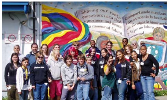
Leaving for PeaceJam Northwest Conference, 2007