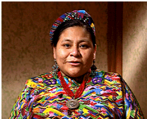
Rigoberta Menchu Tum, Nobel Peace Prize, 1992