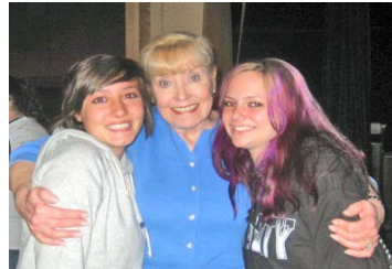
Nobel Peace Laureate Betty Williams with Solano Youth

Youth involved in PeaceJam learn tools to live non-violent, compassionate lives. They